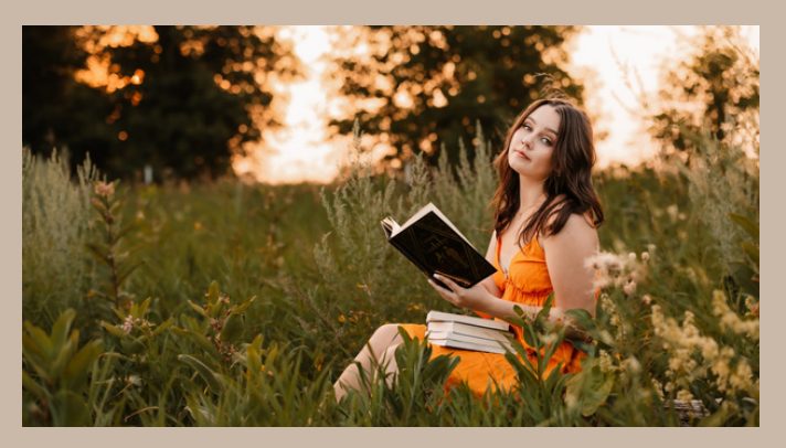
Always bring one outfit that you would typically wear.